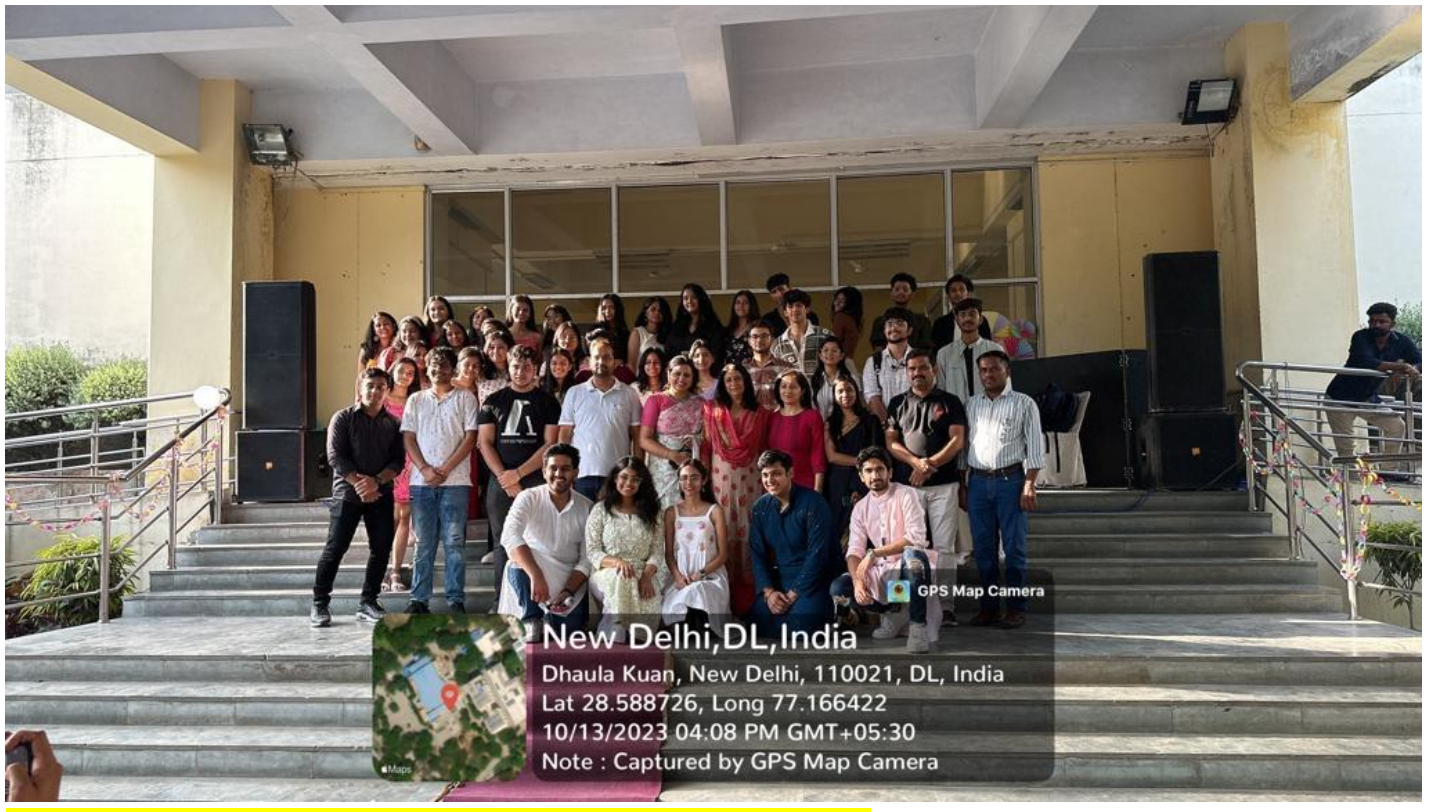
Group photograph of the Commerce Association team with the faculty members.