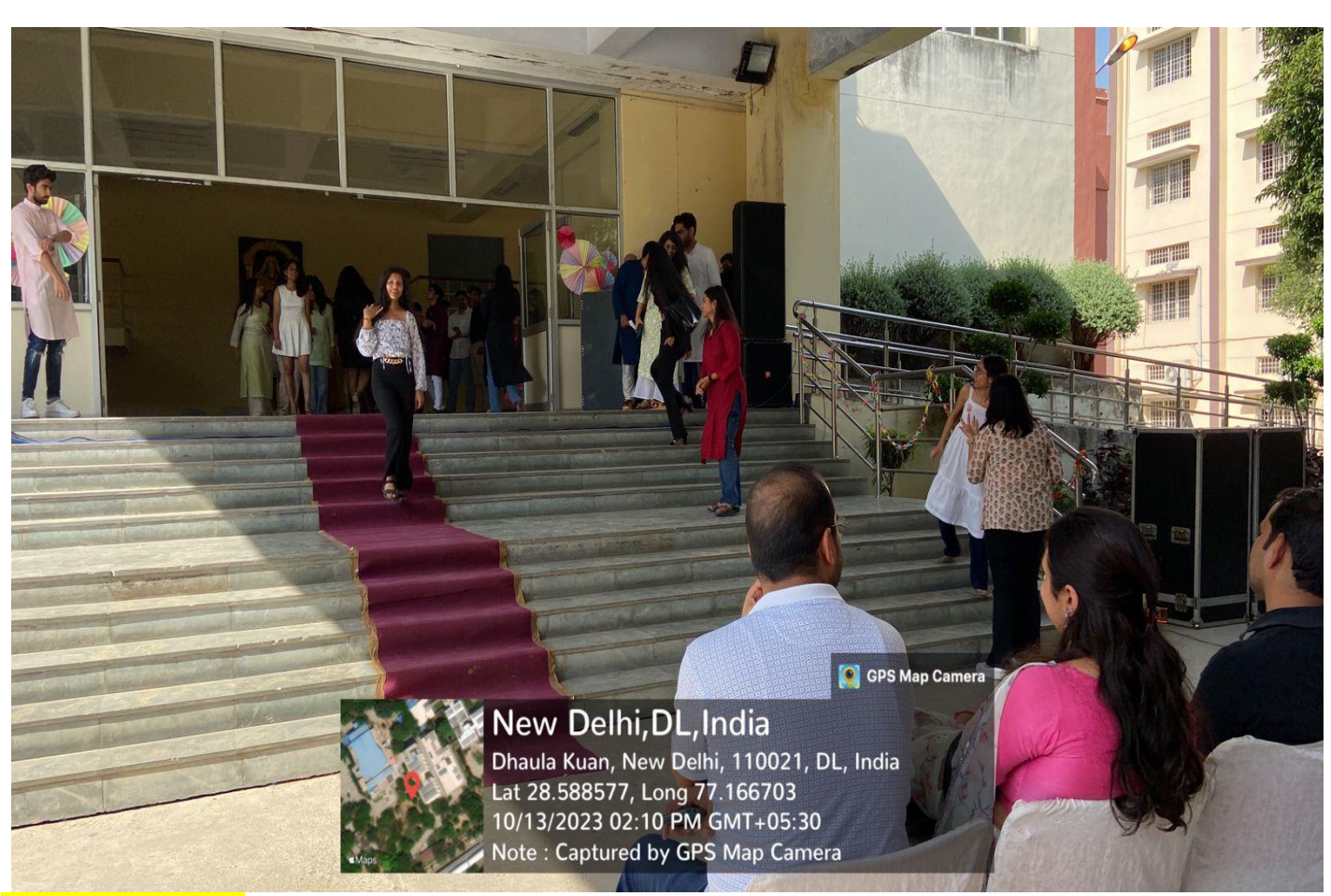
Ramp walks by students