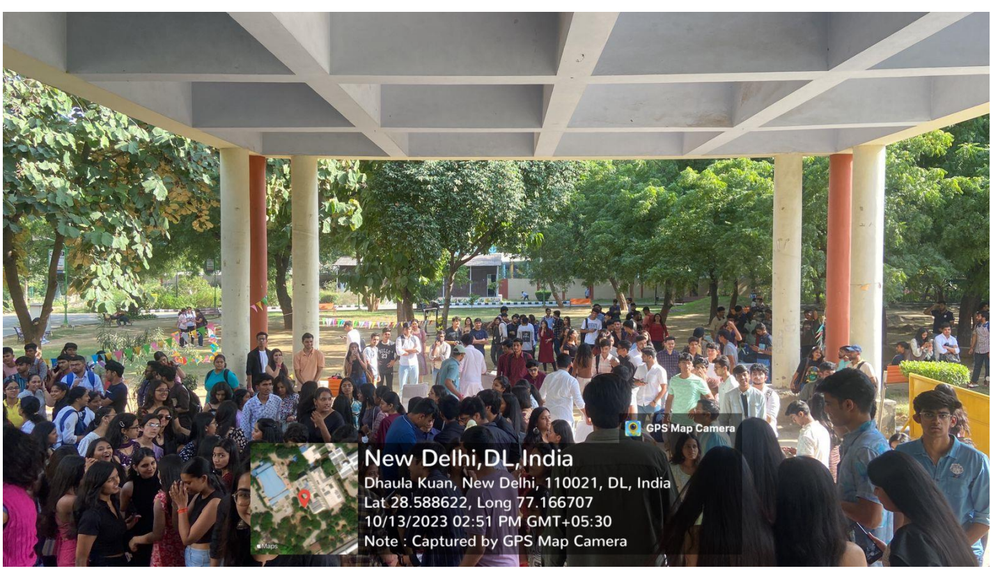
Festivities planned for the students